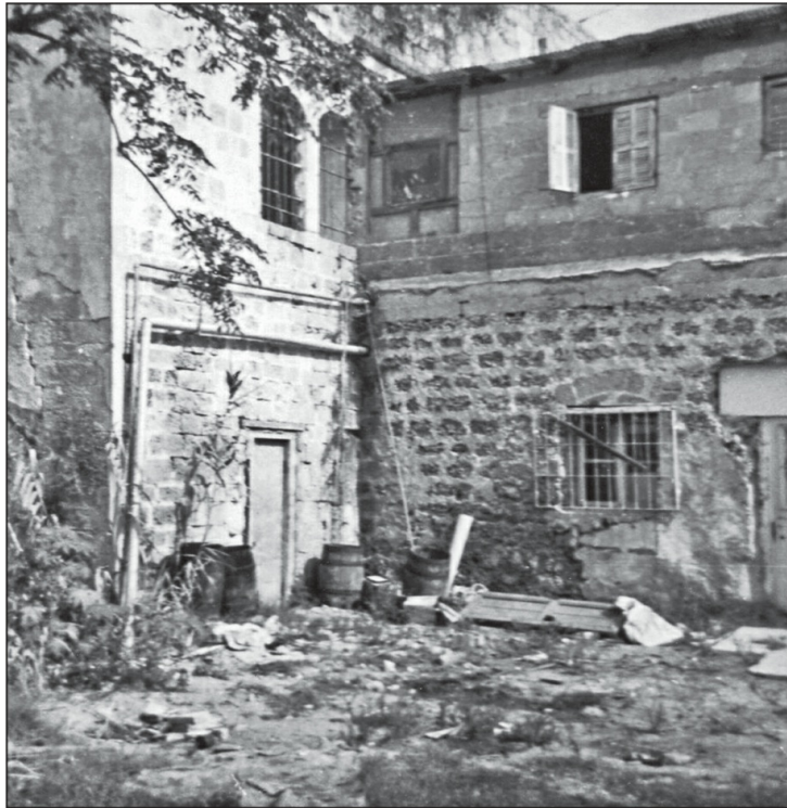
The ruins of the Khalidi family home at Tal al-Rish

would it have been possible to dominate the country without the seizures of land. In a third major and lasting impact of the Nakba, the victims, the hundreds of thousands of Palestinians driven from their homes, served to further destabilize Syria, Lebanon, and Jordan—poor, weak, recently independent countries—and the region for years thereafter.