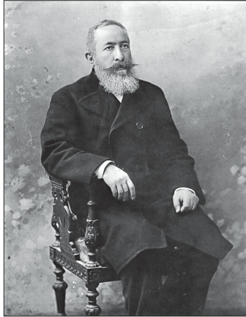
Yusuf Diya al-Din Pasha al-Khalidi

In line with family tradition and his Islamic and Western education, al-Khalidi became an accomplished scholar as well. The Khalidi Library contains many books of his in French, German, and English, as well as correspondence with learned figures in Europe and the Middle East. Additionally, old Austrian, French, and British newspapers in the library show that Yusuf Diya regularly read the overseas press. There is evidence that he received these materials via the Austrian post office in Istanbul, which was not subject to the draconian Ottoman laws of censorship. 7