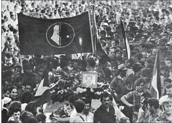
The funeral of Ghassan Kanafani, who was assassinated in a car bombing by the Mossad, Beirut, July 1972