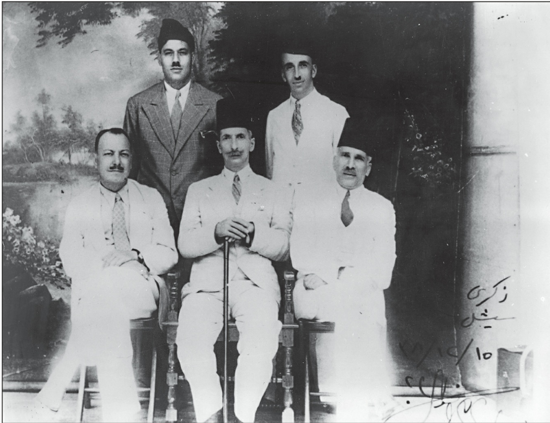
INSTITUTE FOR PALESTINE STUDIES

nearly a year more of fierce fighting, to extinguish the Palestinian uprising.