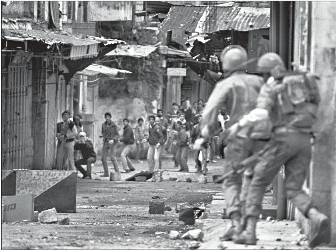
Nablus Casbah, the First Intifada, 1988. There could be no lasting victory for Israel's forces in this kind of cat-and-mouse urban unrest.

The intifada was a spontaneous, bottom-up campaign of resistance, born of an accumulation of frustration and initially with no connection to the formal political Palestinian leadership. As with the 1936–39 revolt, the intifada's length and extensive support was proof of the broad popular backing that it enjoyed. The uprising was also flexible and innovative, developing a coordinated leadership while remaining locally driven and controlled. Among its activists were men and women, elite professionals and businesspeople, farmers, villagers, the urban poor, students, small shopkeepers, and members of virtually every other sector of society. Women played a central role, taking more and more leadership positions as many of the men were jailed and mobilizing people who were often left out of conventional male-dominated politics. 14