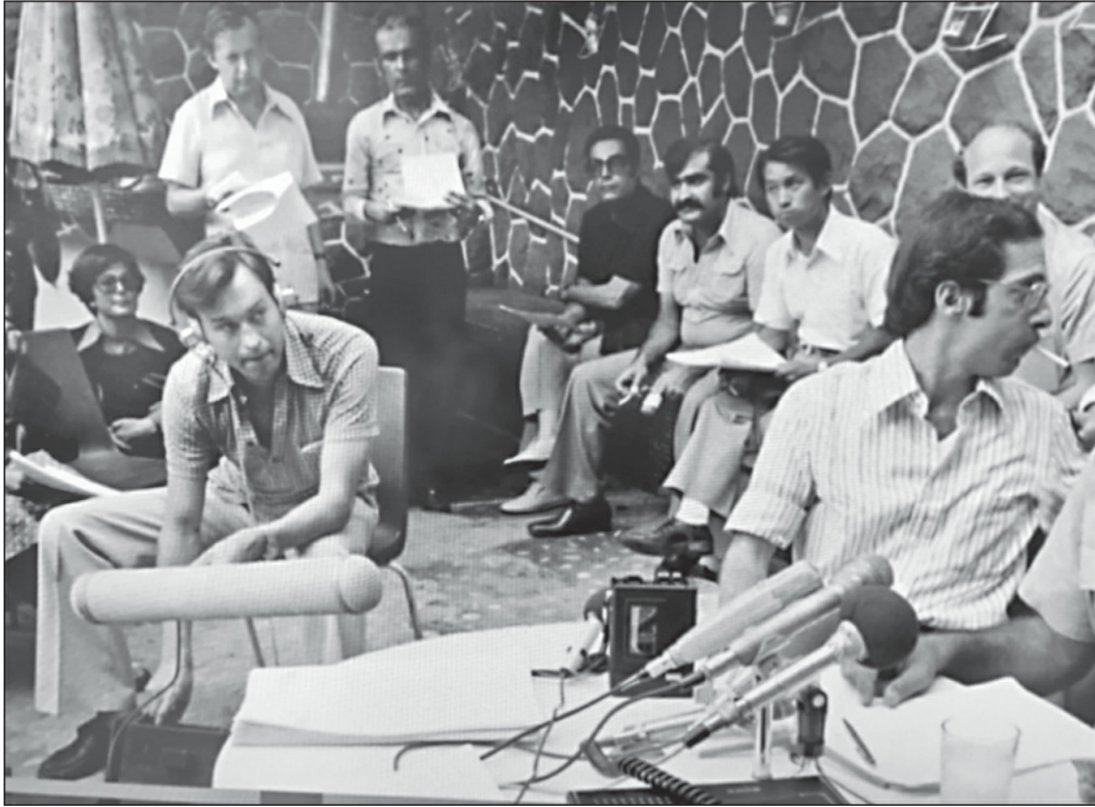
The author, on the right, helping out at a press briefing at the Commodore Hotel, Beirut

The previous July, Israel and the PLO had engaged in an intense two-week exchange of fire across the border, with Israel's aviation and artillery pounding south Lebanon and PLO rocket and artillery units hitting targets across northern Israel. 9 In consequence, large numbers of Lebanese and Palestinian civilians had been forced to flee their homes, while Israelis in Galilee were confined to shelters or fled. This fierce fighting culminated in a July 25, 1981, cease-fire negotiated by US presidential envoy Ambassador Philip Habib, which, remarkably, held for the next ten months with very few violations. 10 However, it was clear that the Begin government and Ariel Sharon were not satisfied with this outcome.