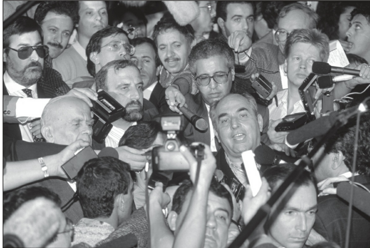
Haydar 'Abd al-Shafi, Hanan 'Ashrawi (concealed by a camera), and Faysal Husayni swamped by the press at the Madrid Peace Conference, 1991. The author is at the back, looking off to the right.

We later learned that this breakthrough was the result of the opening of an undisclosed negotiating track that was completely separate from the secret Oslo talks and has never received the same degree of fame. This was only one of several tracks that Rabin authorized while keeping the existence of each one hidden from those involved in the others. 50 The leading protagonists in the parallel Oslo negotiations, Israeli Foreign Minister Shimon Peres and Ahmad Quray' (Abu al-'Ala'), had richly deserved reputations as relentless self-promoters, and it was to be expected that they would ensure that their story obliterated any other, which is just what happened. 51 By contrast, Rabin and 'Arafat used confidential intermediaries to come to a quiet understanding on the key issue of security, which was an essential precondition and the basis for the success of the better-known and more exhaustive Oslo process that was simultaneously underway.