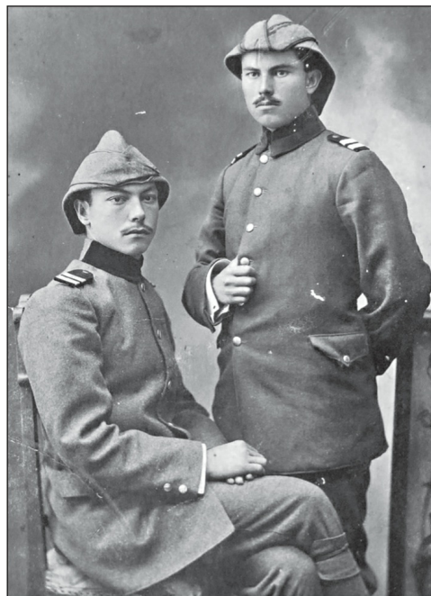
THE KHALIDI LIBRARY