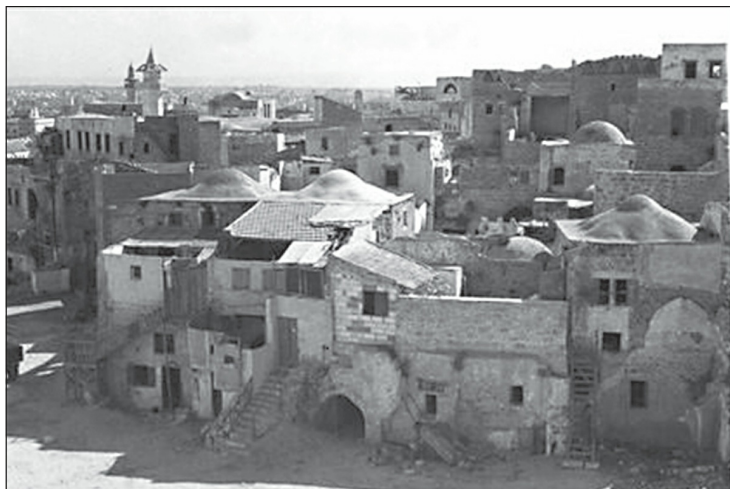
Jaffa in 1948, emptied during Plan Dalet